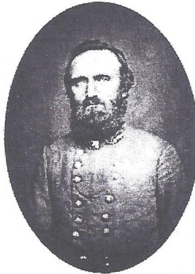
THOMAS "STONEWALL" JACKSON