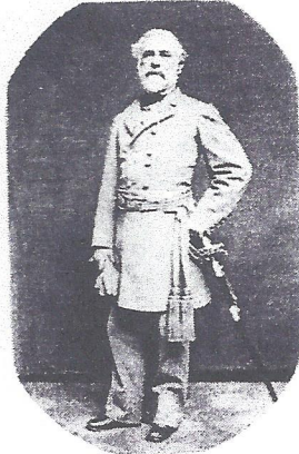
ROBERT E. LEE