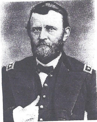
ULYSES S. GRANT