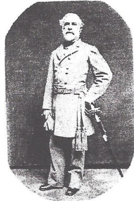
ROBERT E. LEE