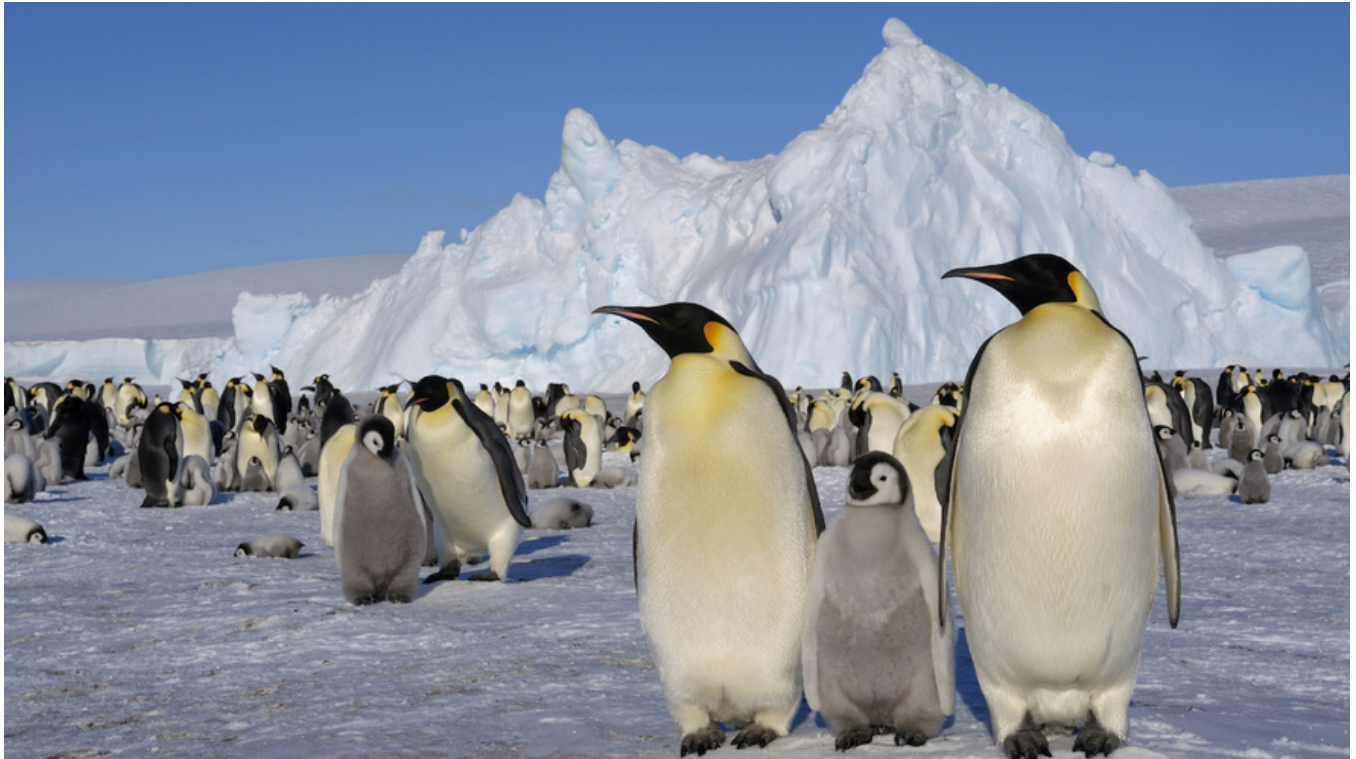
Image 1. A family of emperor penguins hanging out on Snow Hill Island. This island is found in the Weddell Sea in the Antarctic.